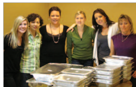
United Way Day of Caring volunteers prepared over 20 lasagnas to be shared with VITA & Mens Sana programs.

The partnership between Mens Sana and United Way also provides the members a chance to get involved in the community. The members had a chance to attend the VITA cook-off, at which they were able to