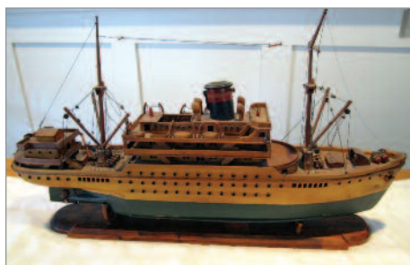
Wooden ship said to have been carved by an internee held in Camp Petawawa.