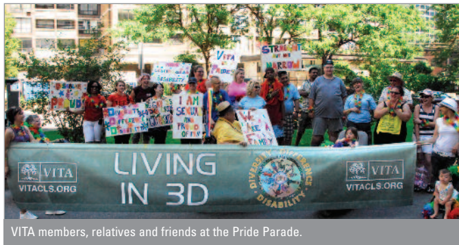
VITA members, relatives and friends at the Pride Parade.

The LGBT group continues to meet and continues to provide support. VITA's participation in Pride Day has led to a collaboration between groups in the city of Toronto and in