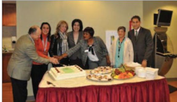
Villa Vaughan celebrates with the 2010 Maria Di Salvo award recipients.