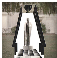
HV Studio/ De Luca Fine Art Gallery (Toronto, ON)